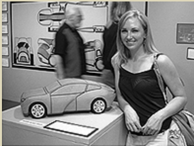
Industrial Design Student, The Art Institute of California, Orange County

new parents realized that I had several heart defects, which, if not corrected, would lead to a poor life. I underwent full heart surgery. Fortunately, after all my surgeries I became healthy. Somehow, this surgery planted the seed that would determine my future career goal. I knew that I have the makings to go into the medical field and help others who needed such surgery.