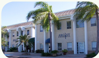
Argosy University/Sarasota, Florida

EDMC Education Foundation and the 18 Argosy Universities are quickly building a scholarship fund base, with numerous business, employee, alumni, and family contributions.