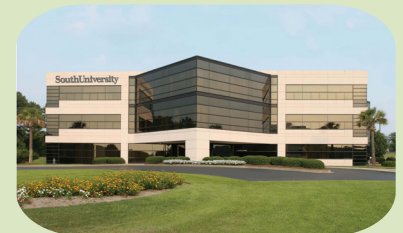
SouthUniversity/Columbia, South Carolina

South University became a part of the EDMC family in 2003. During the past few years, we educated the faculty, staff and leadership about the benefits of the Foundation and we have begun to see a growing network of support on a number of South University campuses.